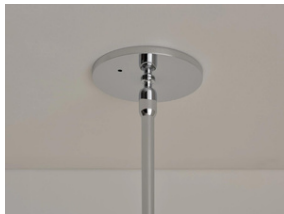
CHROME PLATED BRASS