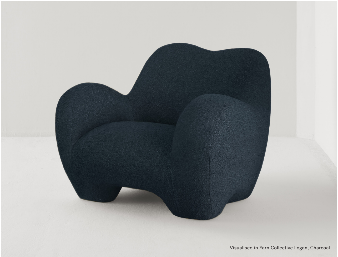
Visualised in Yarn Collective Logan, Charcoal