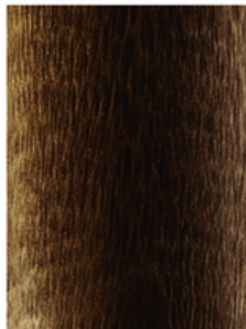
TEXTURED BRASS AGED