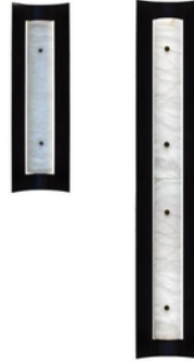
TALLIS WALL LIGHT

Requires 12V 10/20W constant voltage LED driver mounted in back box or wall cavity.