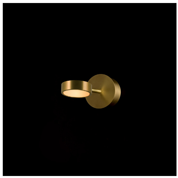
SOFTSPOT WALL HORIZONTAL