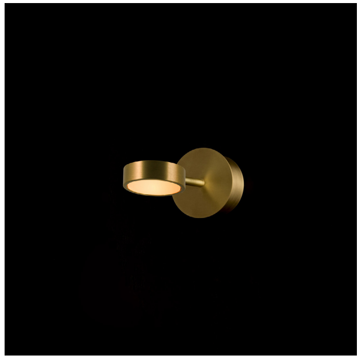
SOFTSPOT WALL HORIZONTAL

Proprietary Softspot75 LED, 9W, 380 Lumens, 2700K warm white. CRI>95. 50% downwards and 50% upwards