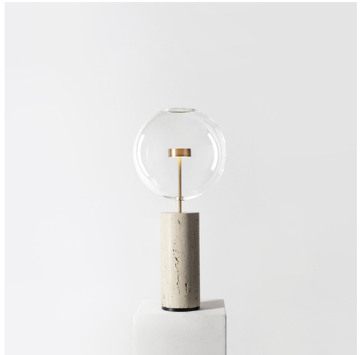
SOFFIO TABLE 30

Proprietary Softspot75 LED, 9W, 380 Lumens, 2700K warm white. CRI>95. 25% downwards and 75% upwards