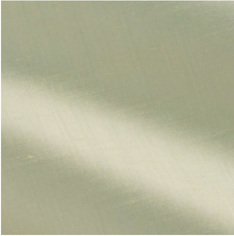
SARI - RAW SILK - PIERRE FREY The full range of colors is available