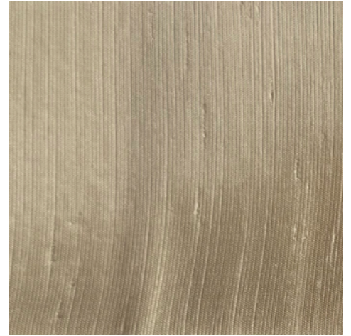
CHAVIÈRES - POLYESTER - DESIGNERS GUILD The full range of colors is available Fire-retardant treated fabric