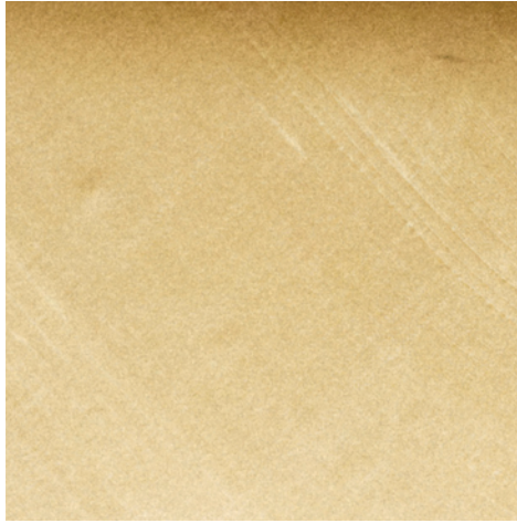
CHINON II - RAW SILK - DESIGNERS GUILD The full range of colors is available