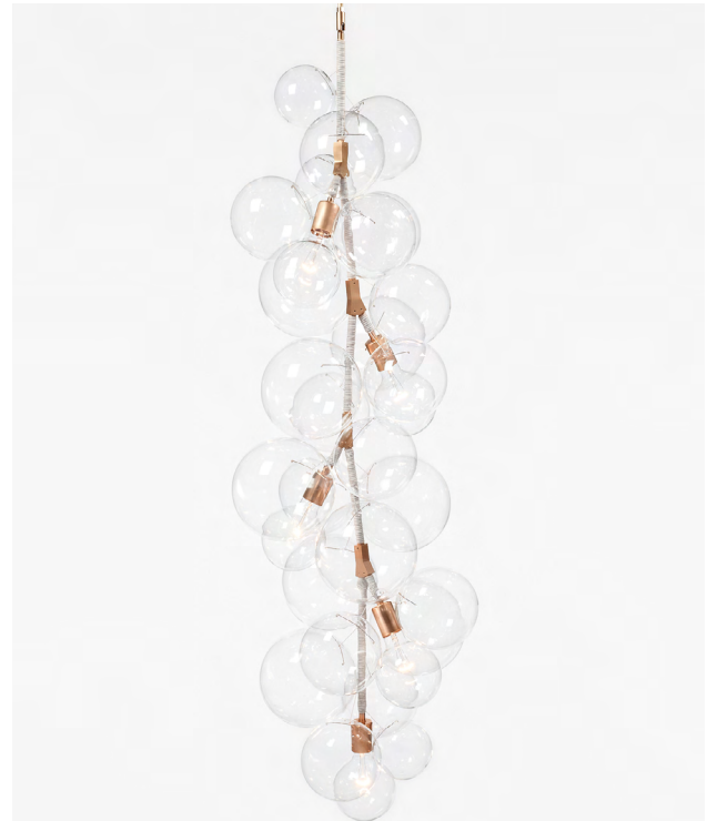
X-Tall Bubble Chandelier pictured with Satin Brass metal finish and White Leather coiling