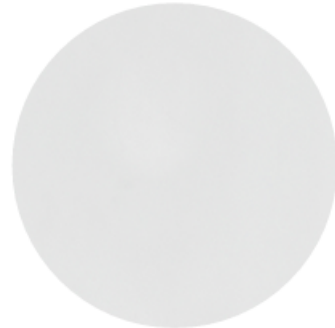
White Powder Coat