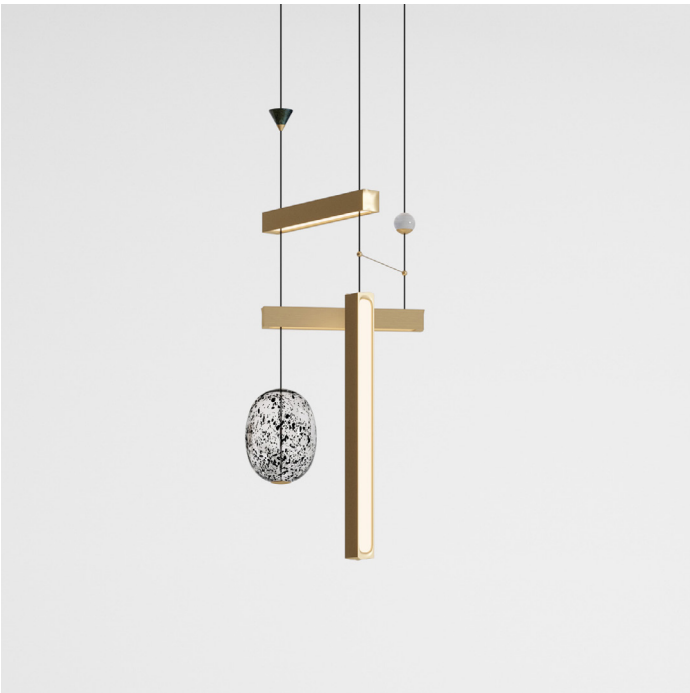
MILKY WAY CHANDELIER VERTICAL 125

Strip LEDs, 60.1W, 4920 Lumens, 2700K warm white. CRI>90.