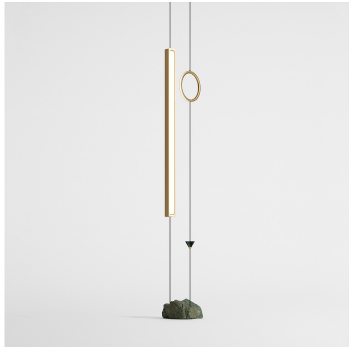
MILKY WAY FLOOR-TO-CEILING COLUMN

Strip LEDs. 53W, 4340 Lumens, 2700K warm white. CRI>90.