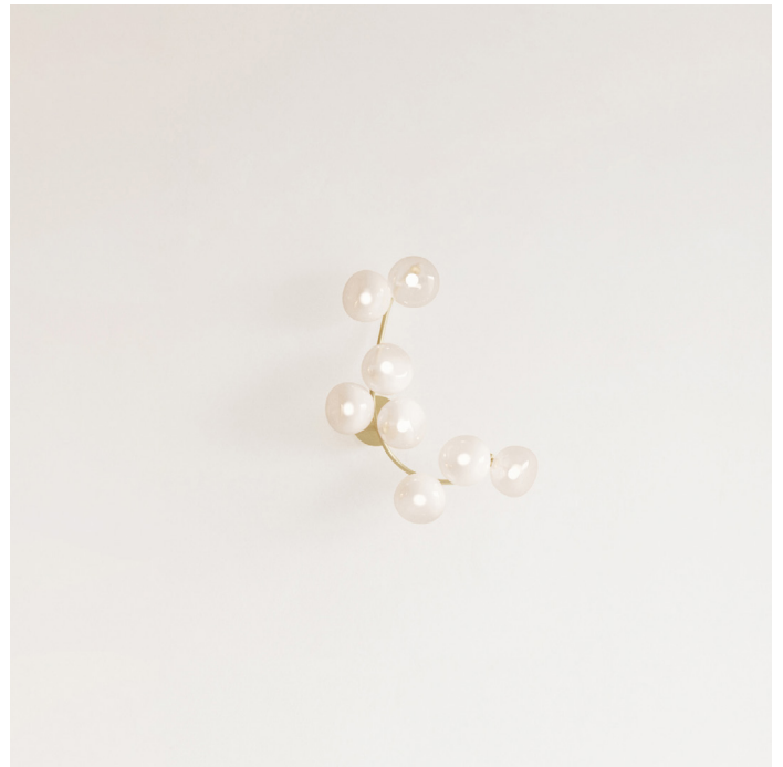
MAEHWA CEILING WALL 8

8 Proprietary Maehwa LEDs 7.8 W, 960 lm, 2700K warm white. CRI>95. Energy label A.