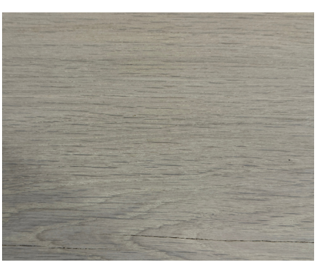
WHITE WASHED OAK