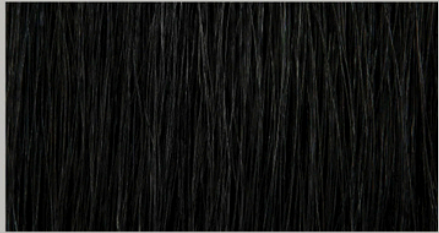
HORSEHAIR - JET BLACK