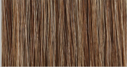
HORSEHAIR - FLAXEN