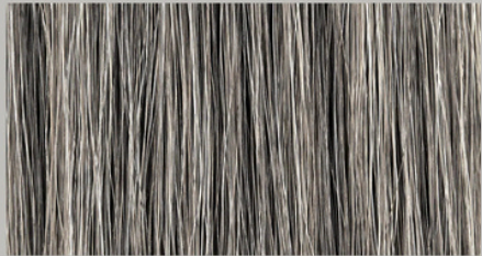
HORSEHAIR - SILVER