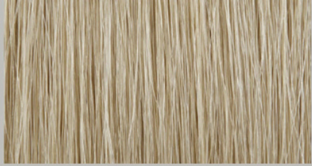
HORSEHAIR - PALOMINO