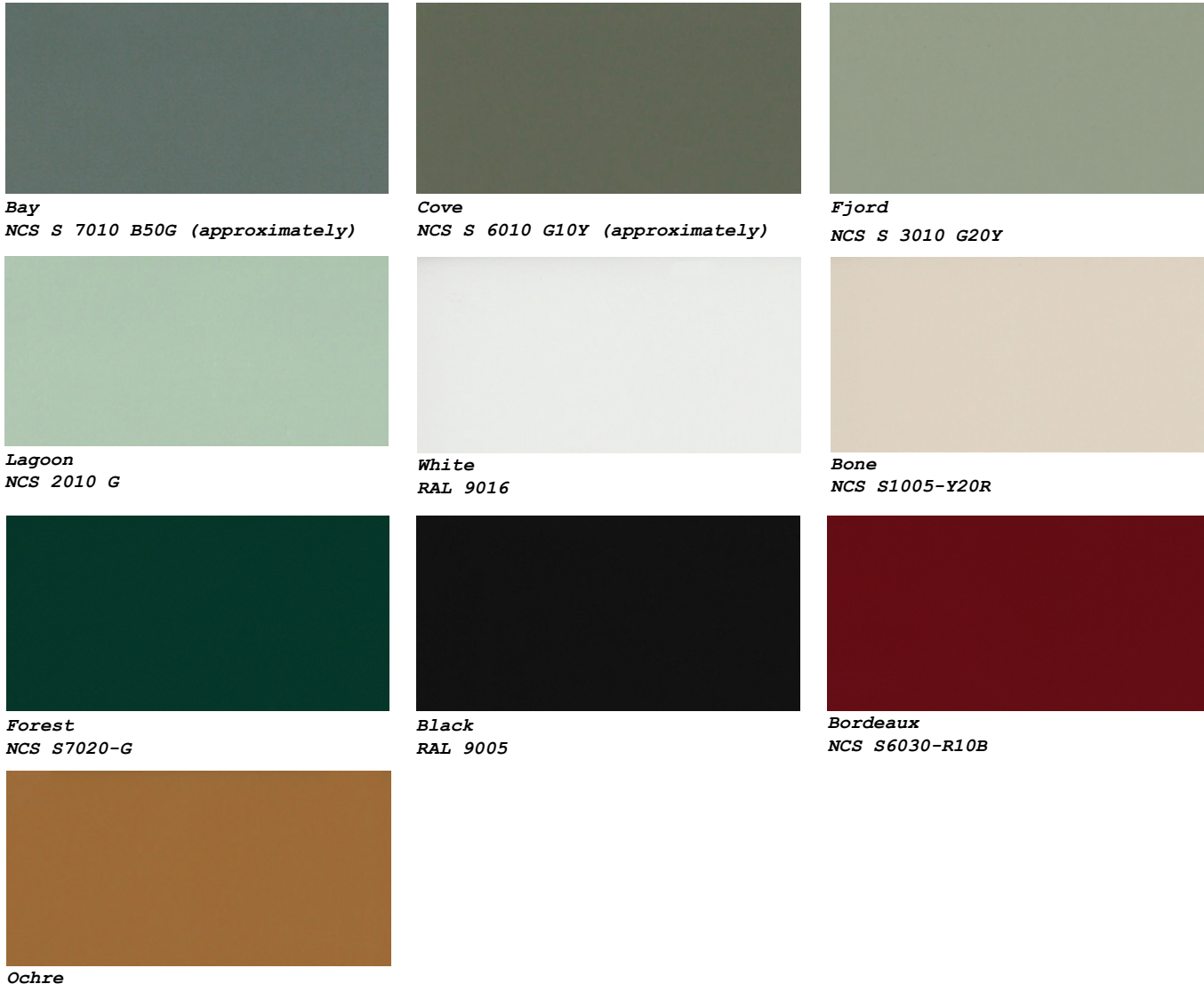
NCS S 4040-Y20R

Fibreglass is painted to create our satin matte finish, or painted then coated in clear lacquer to create our gloss finish.