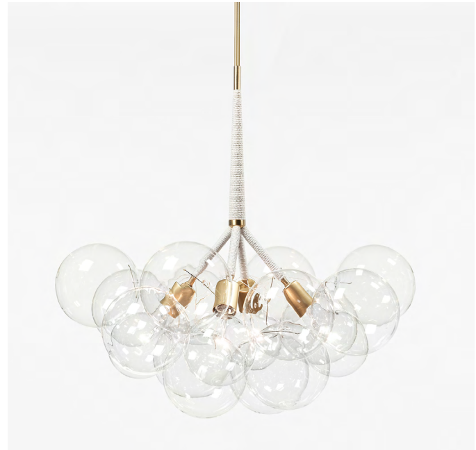
X-Large Bubble Chandelier pictured with Satin Brass metal finish and Natural Cotton coiling