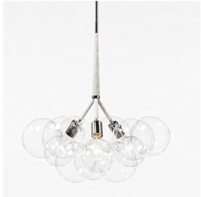
Large Bubble Chandelier pictured with Polished Nickel metal finish and White Leather coiling