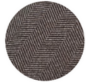
Charcoal Gray - Herringbone