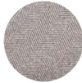
Heather Gray - Herringbone