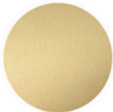
Satin Brass - Base/Hardware