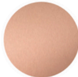
Satin Copper - Base/Hardware