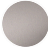
Satin Nickel - Base/Hardware