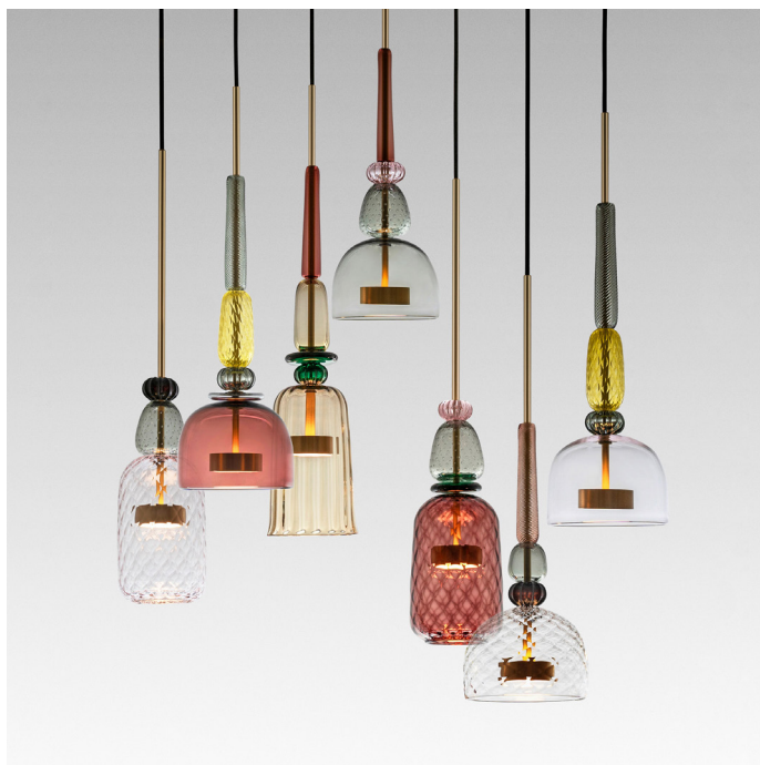
FLAUTI CHANDELIER CIRCULAR 71

FLPE06, FLPE23, FLPE29, FLPE08, FLPE26, FLPE07, FLPE05