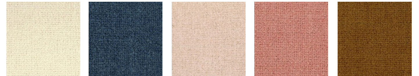
90302 Douceur d'ange 90347 Le ciel entier 90359 Coraux tièdes 90351 Au plumage de feu 9079 L'odeur de la terre