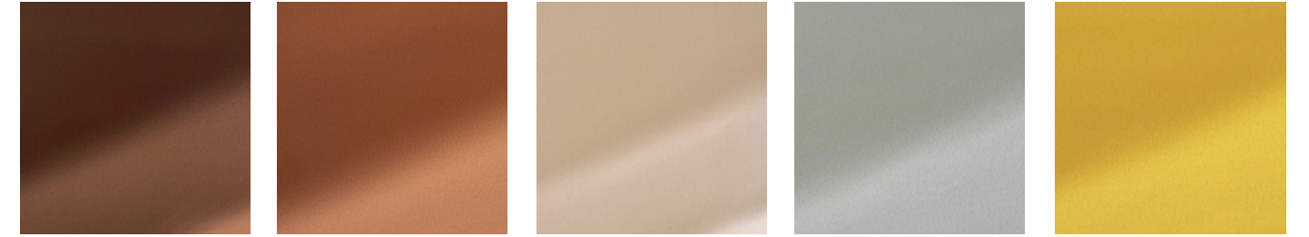
19010 Mowgli 19015 Blush 19002 Sand Stone 19028 Milky Mint 19020 Saffron