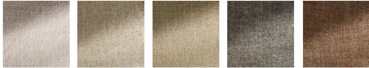
33702 Coquillage 33705 Quinoa 33706 Dune 33709 Pigeon 33711 Tabacco