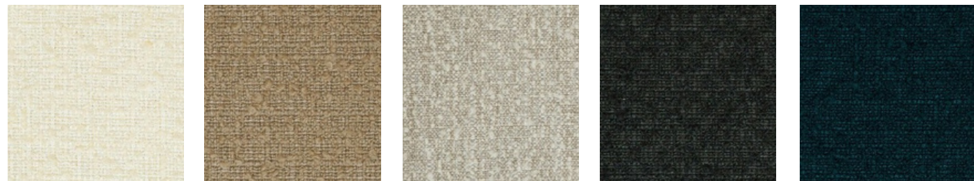
71360-001Ivoire 71360-003Beige 71360-005Ficelle 71360-007Anthracite 71360-010Marine