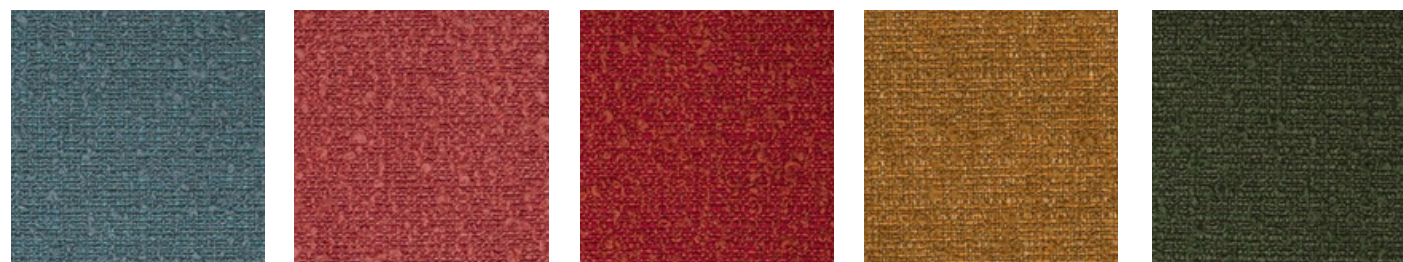
71360-012Prusse 71360-015Terracotta 71360-019Brique 71360-020Doré 71360-023Armée