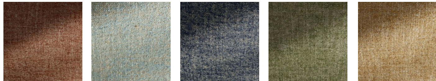
33712 Terracotta 33719 Cloud 33720 Marine 33725 Cactus 33727 Honey