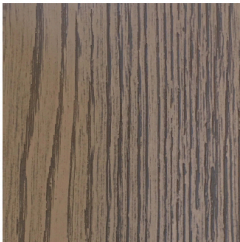
CH.101.005.B brushed oak / matt