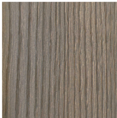
CH.205.005.B brushed oak / matt