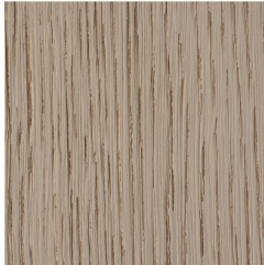
CH.032.005.B brushed oak / matt