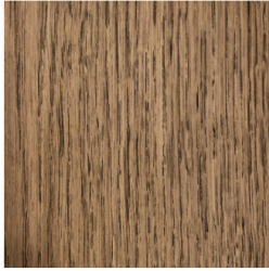
CH.563.005 smooth oak / matt