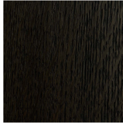
CH.892.005.B brushed oak / matt