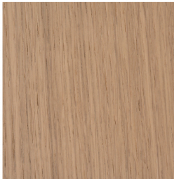
CH.010.005 smooth oak / matt