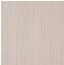
CH.099.005 smooth oak / matt