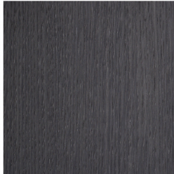
CH.559.005.HY hardened oak / matt