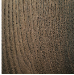
CH.762.005.B smoked brushed oak / matt