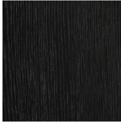
CH.853.005.B brushed oak / matt