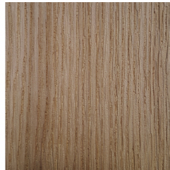
CH.044.005.B brushed oak / matt