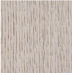
CH.099.005.B brushed oak / matt