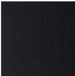
CH.097.005 smooth oak / matt