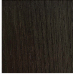
CH.912.005 smooth oak / oiled matt