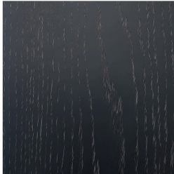
CH.284.005 smooth oak / matt