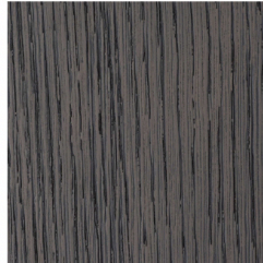
CH.071.005.B brushed oak / matt