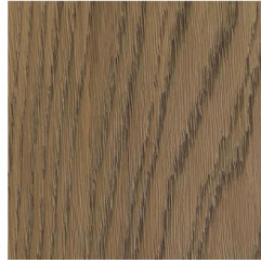
CH.841.005.B brushed oak / matt