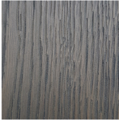
CH.177.005.B brushed oak / matt