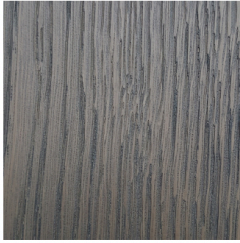
CH.107.005.B brushed oak / matt