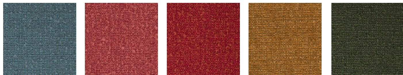
71360-012Prusse 71360-015Terracotta 71360-019Brique 71360-020Doré 71360-023Armée