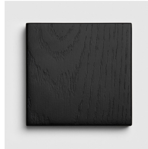
BLACK Ash Ebony Stain, 5 Sheen Varnish