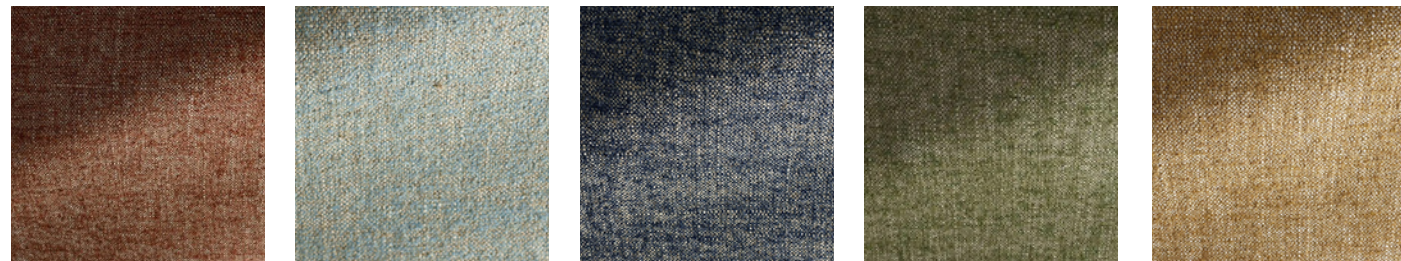
33712 Terracotta 33719 Cloud 33720 Marine 33725 Cactus 33727 Honey