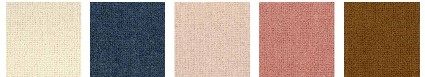
90302 Douceur d'ange 90347 Le ciel entier 90359 Coraux tièdes 90351 Au plumage de feu 9079 L'odeur de la terre