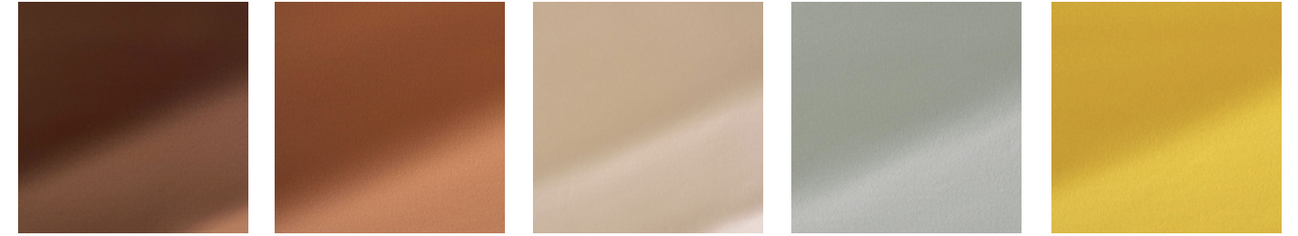
19010 Mowgli 19015 Blush 19002 Sand Stone 19028 Milky Mint 19020 Saffron