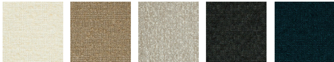
71360-001Ivoire 71360-003Beige 71360-005Ficelle 71360-007Anthracite 71360-010Marine