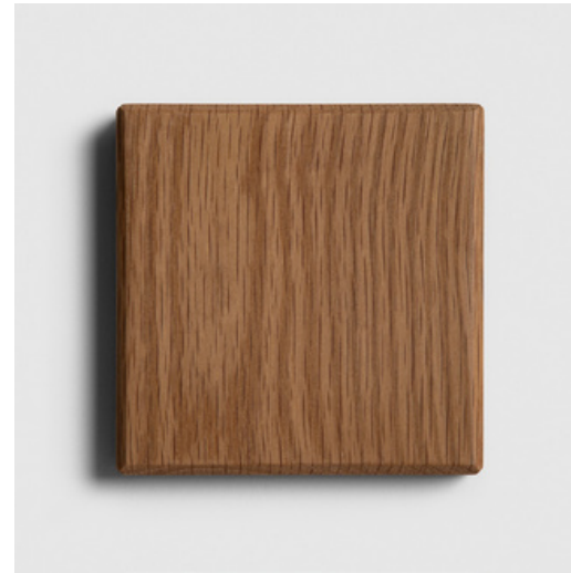
ORGANIC Oak Ultra Matte Varnish