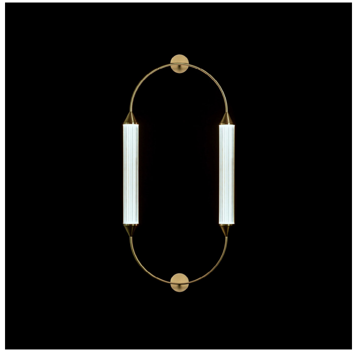
CIRQUE CEILING/WALL ELLIPSE