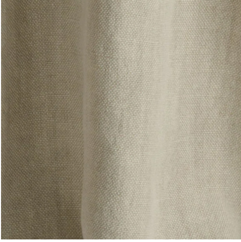
CHEYENNE - LINEN - PIERRE FREY The full range of colors is available