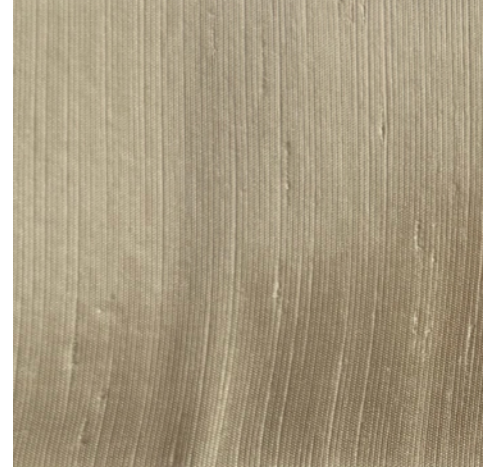
CHAVIÈRES - POLYESTER - DESIGNERS GUILD The full range of colors is available Fire-retardant treated fabric