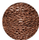
Aged Copper Cuivre Antique