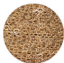
Aged Brass Laiton Antique