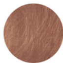
Aged Copper Cuivre Antique