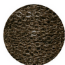
Aged Bronze Bronze Antique