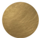
Aged Brass Laiton Antique