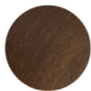
Aged Bronze Bronze Antique