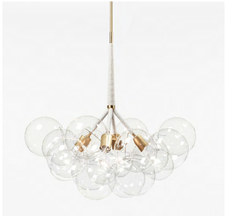
X-Large Bubble Chandelier pictured with Satin Brass metal finish and Natural Cotton coiling