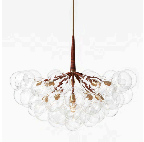
Supra Bubble Chandelier pictured with Satin Brass metal finish and Dark Brown Leather coiling