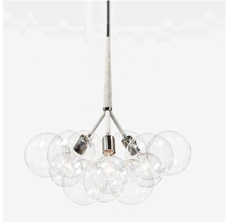
Large Bubble Chandelier pictured with Polished Nickel metal finish and White Leather coiling