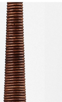
Dark Brown Leather