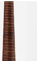
Dark Brown Leather