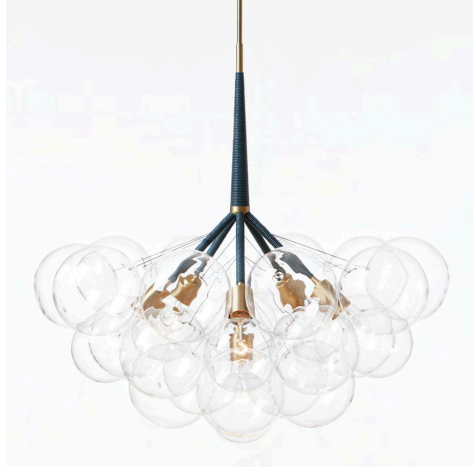
Jumbo Bubble Chandelier pictured with Satin Brass metal finish and Iris Blue Leather coiling