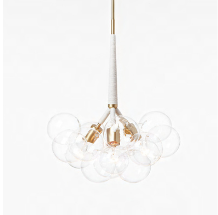
Original Bubble Chandelier pictured with Satin Brass metal finish and Natural Cotton coiling