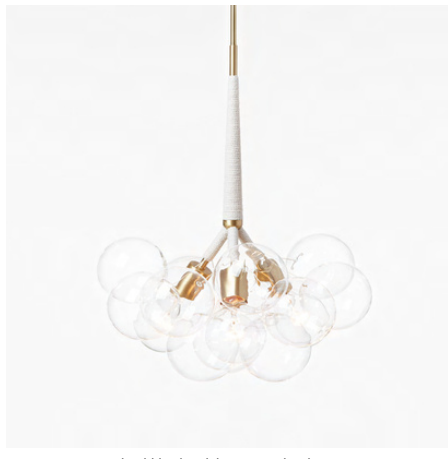
Original Bubble Chandelier pictured with Satin Brass metal finish and Natural Cotton coiling