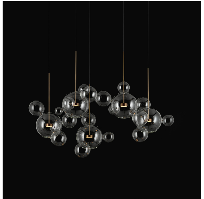
BOLLE CHANDELIER ZIGZAG 24 BUBBLES

5 Proprietary Softspot75 LEDs, 45W, 1900 Lumens, 2700K warm white. CRI>95. 75% downwards and 25% upwards