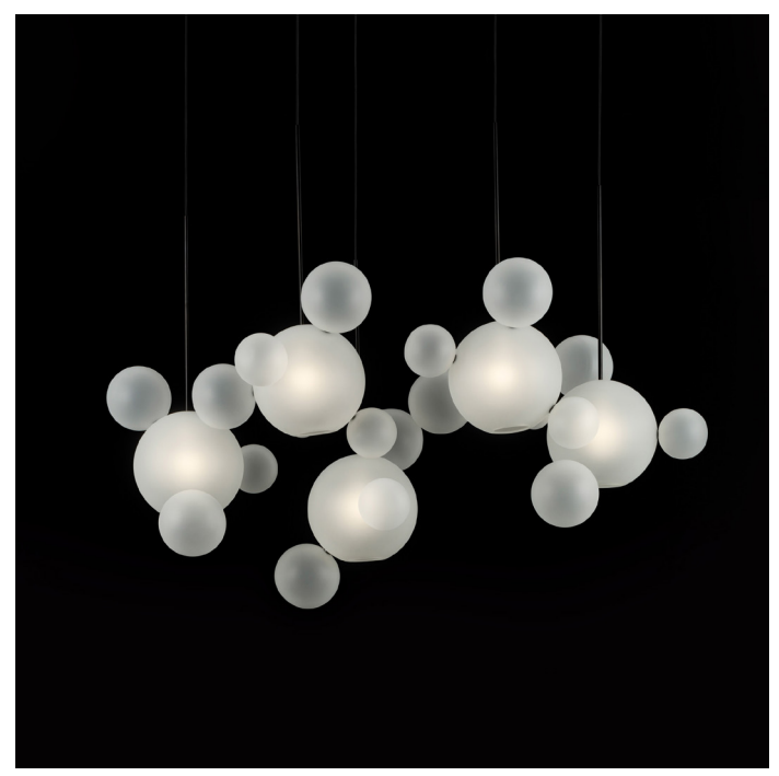
BOLLE FROSTED CHANDELIER ZIGZAG 24 BUBBLES