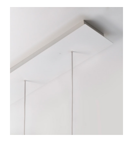
White Fabric Flex Cable