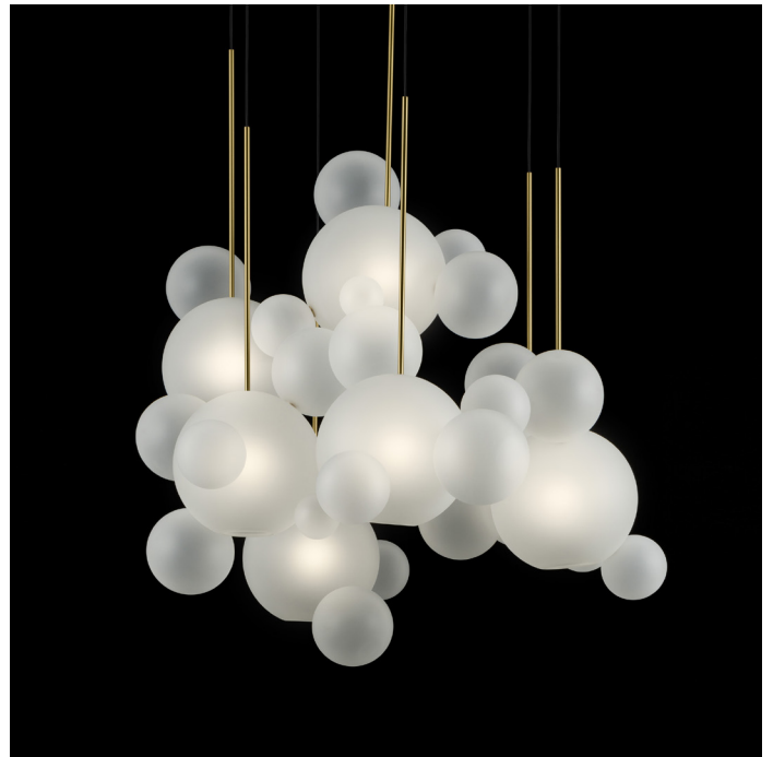
BOLLE FROSTED CHANDELIER CIRCULAR 34 BUBBLES