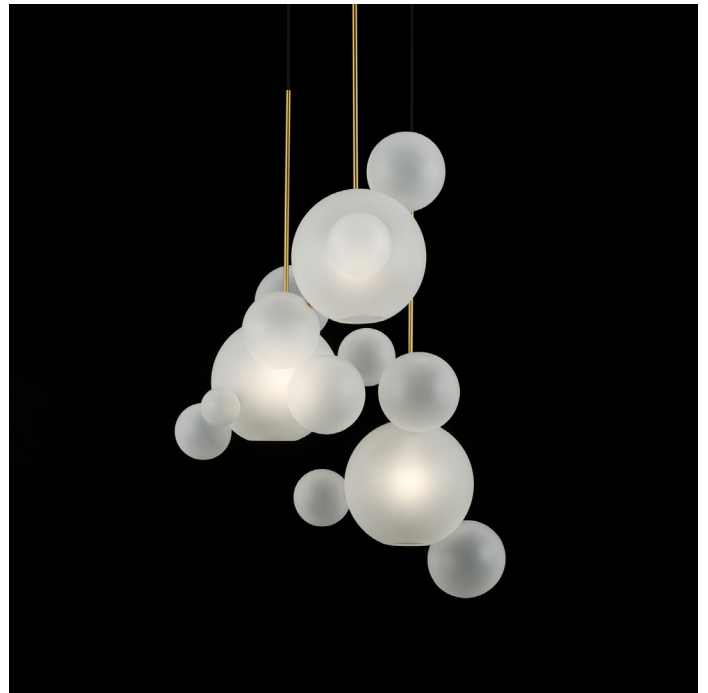
BOLLE FROSTED CHANDELIER CIRCULAR 14 BUBBLES