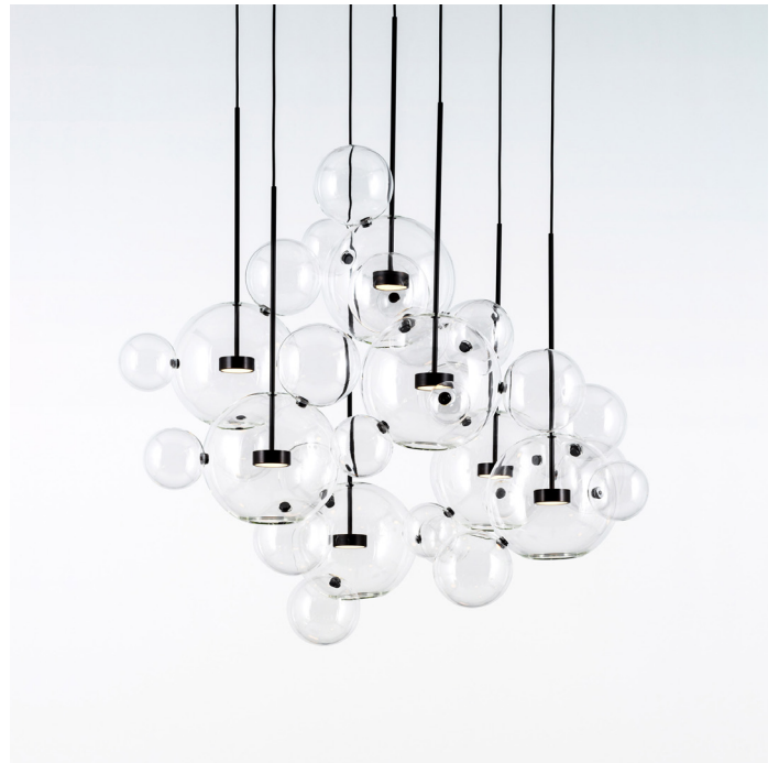
BOLLE CHANDELIER CIRCULAR 34 BUBBLES

7 Proprietary Softspot75 LEDs, 63W, 2660 Lumens, 2700K warm white. CRI>95. 75% downwards and 25% upwards