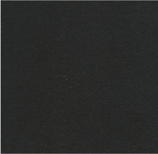
STEEL POWDERCOATED BRONZE