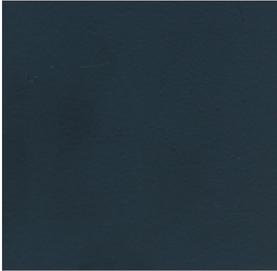
STEEL POWDERCOATED BLACK