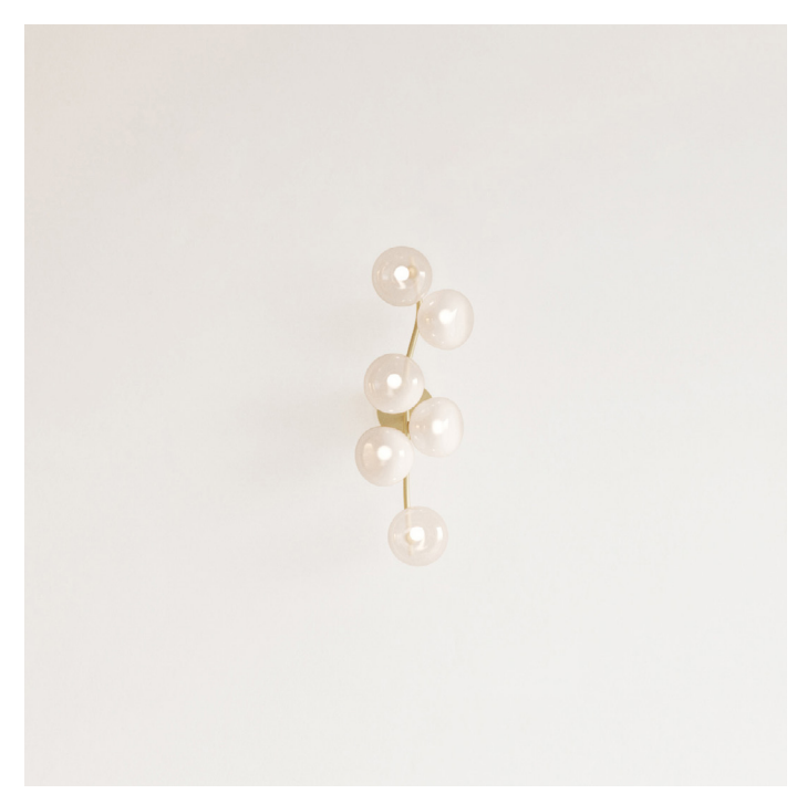
MAEHWA CEILING WALL 6

6 Proprietary Maehwa LEDs 6 W, 720 lm, 2700K warm white. CRI>95.Energy label A.