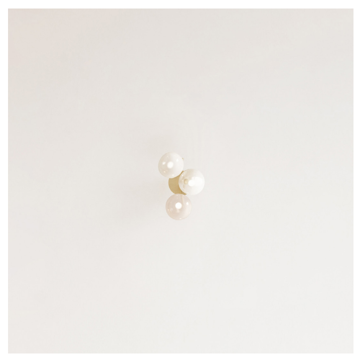
MAEHWA CEILING WALL 3

3 Proprietary Maehwa LEDs 3 W, 360 lm, 2700K warm white. CRI>95.Energy label A.