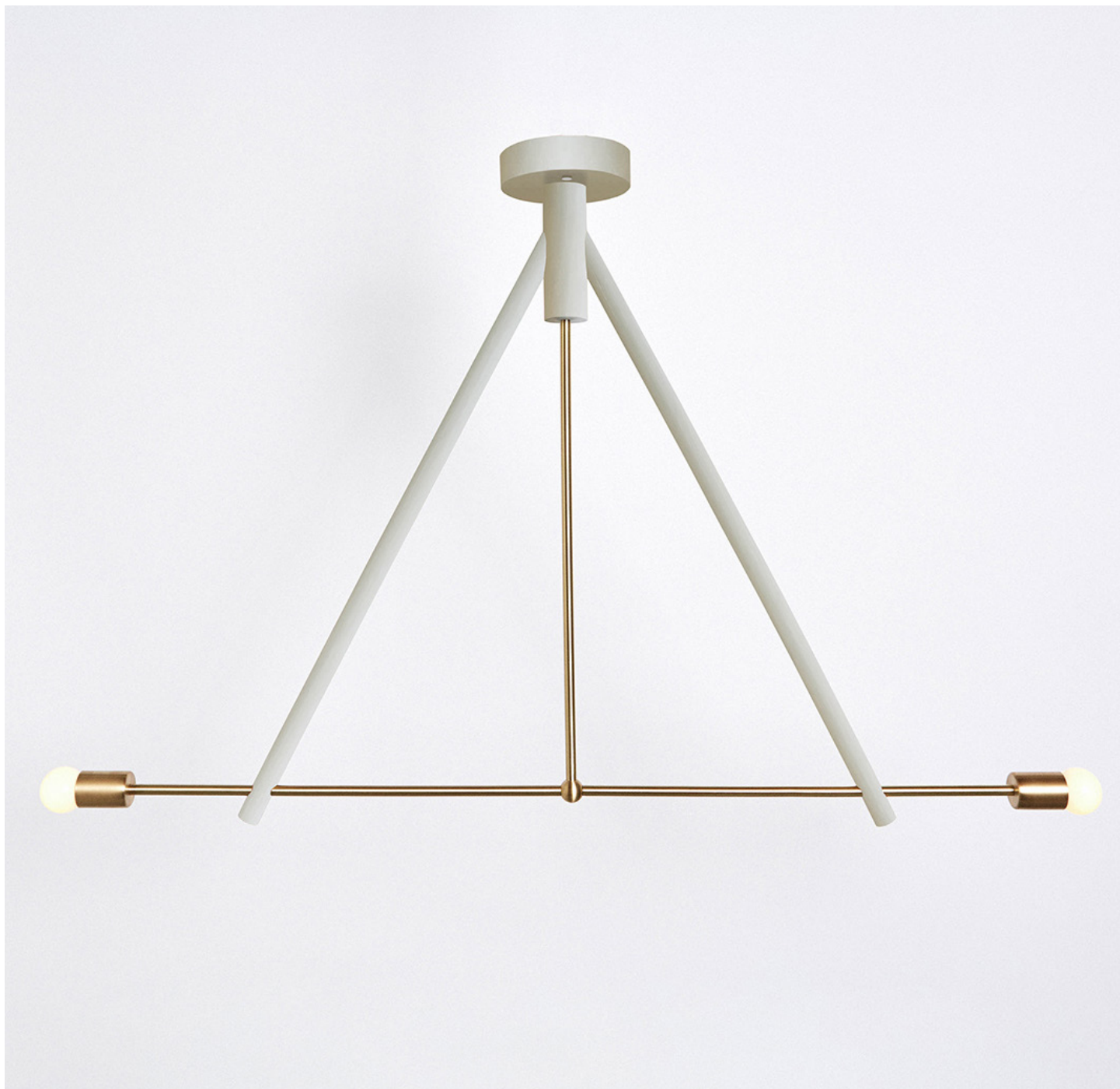
LODGE CHANDELIER II painted white