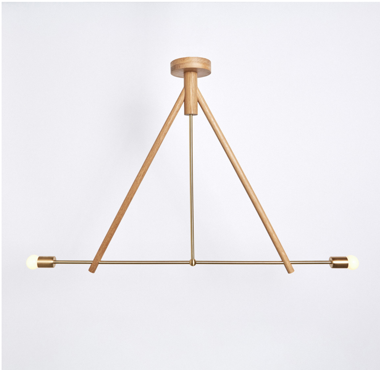
LODGE CHANDELIER II natural oak