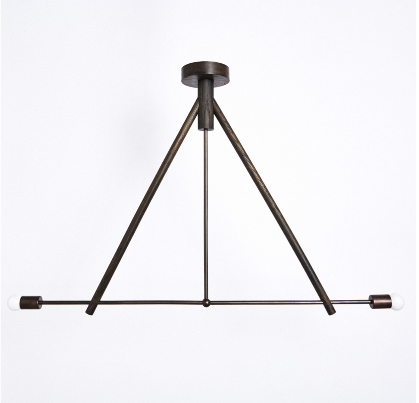
LODGE CHANDELIER II oxidized ash