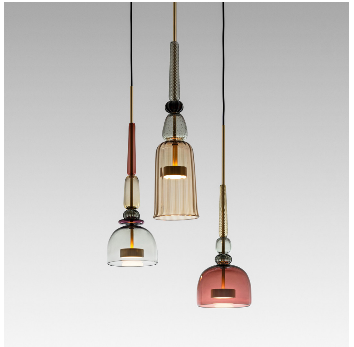
FLAUTI CHANDELIER CIRCULAR 32